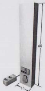
Switchboard + double socket